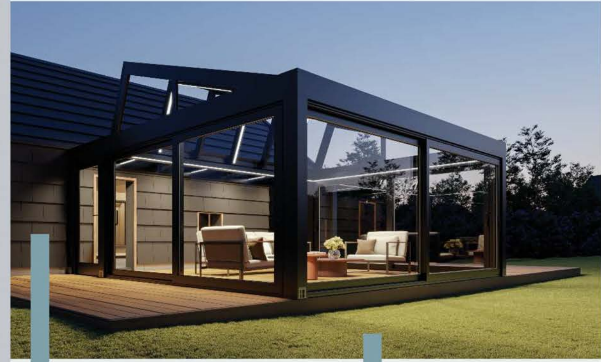
WINTERGARDEN / SUNROOM

There is no need to carry the realities in your dreams. Comfort wrapped in shield. Polad system, designed by talented Schildr engineers known for their innovative approaches, stands as a pioneering winter garden model that seamlessly blends classical and modern design elements. In many regions, the challenge of varying back heights during winter garden assembly is a common issue. Steel structure embedded in aluminum profiles addresses this concern by ensuring an equal load distribution across the floor, which makes it different from numerous other winter gardens. Depending on the spacing between the supports, it allows for a convenient connection of the system's perimeter with panoramic sliding systems. A well-conceived water channel integrated throughout the system efficiently and quietly directs excess water out through a plastic conduit. This model offers users superior comfort, clear panoramic views, excellent illumination, year-round usability, and direct communion with nature.